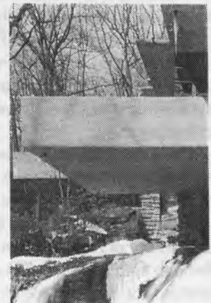
Photographs of Frank Lloyd Wright's Fallingwater

From the De Stijl mecca of Frank Lloyd Wright's Kaufmann House ("Fallingwater") to the frenetic energy of Andy Warhol's Factory, there is everything in between awaiting in Pittsburgh, where SAH/SCC is leading a Memorial Day Weekend tour.