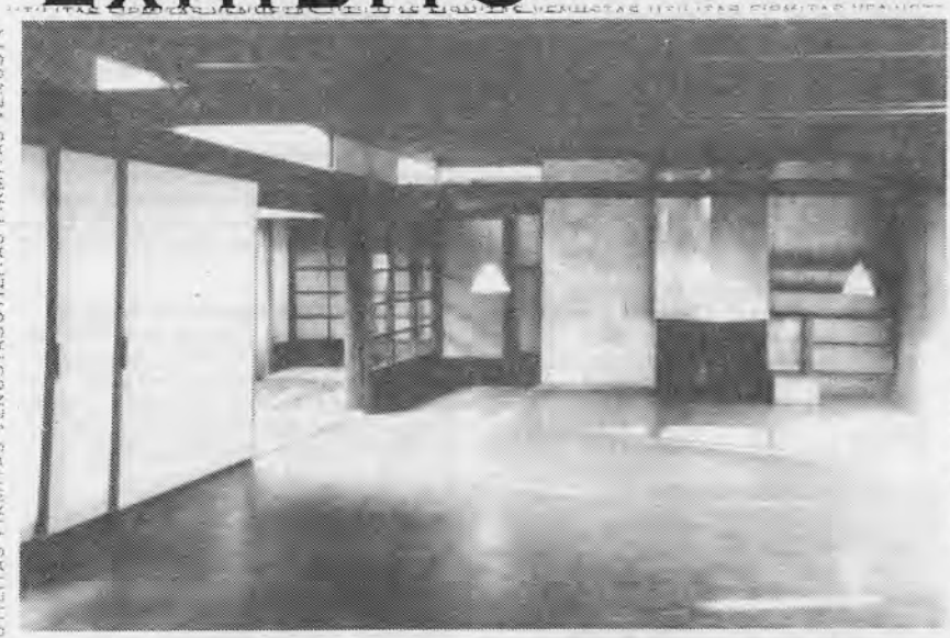
The MAK Center for Art and Architecture resides at the legendary Schindler House on King's Road, which is undergoing a five-year renovation, during which time visitors will see the house in pure form, unadorned by furnishing and decor.

UTILITAS FIRMITAS VENUSTAS UTILITAS FIRMITAS VENUSTAS UTILITAS FIRMITAS VENUSTAS UTILITAS FIRMITAS VENUSTAS UTILITAS FIRMITAS VENUSTAS UTILITAS FIRMITAS VENUSTAS UTILITAS FIRMITAS VENUSTAS UTILITAS FIRMITAS VENUSTAS UTILITAS FIRMITAS VENUSTAS