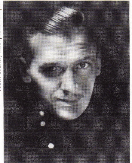
Above: Photograph of Douglas Fairbanks, Jr. by Hurrell, c.1933, to be sold at Metropolitan Antiques' Hollywood Photography Auction on February 21, 1995