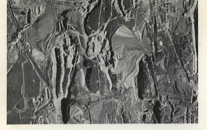
An anthracite coal mine