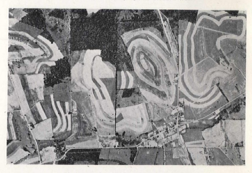
The strange symbols of contour planning