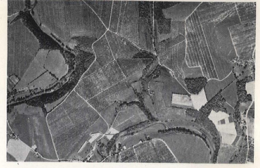
A locality of neatly spaced orchard trees