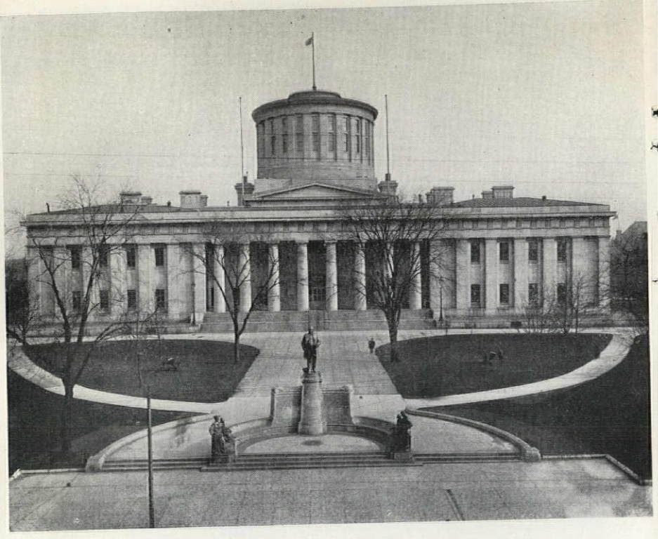
Do you know this building?

тне state house, согимвиs, онто—1839-56 кеlly, тне state house, согимвиs, онто—1839-56