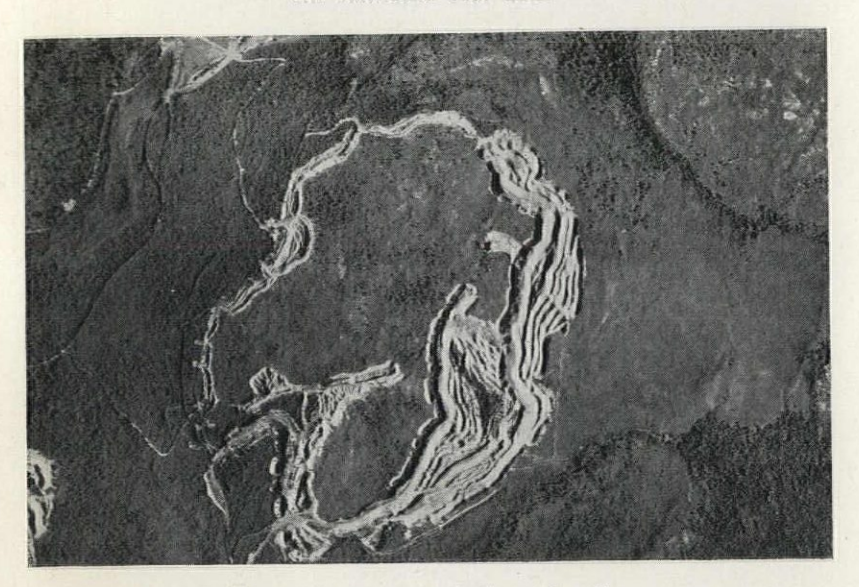
The earthworm pattern of a strip mine