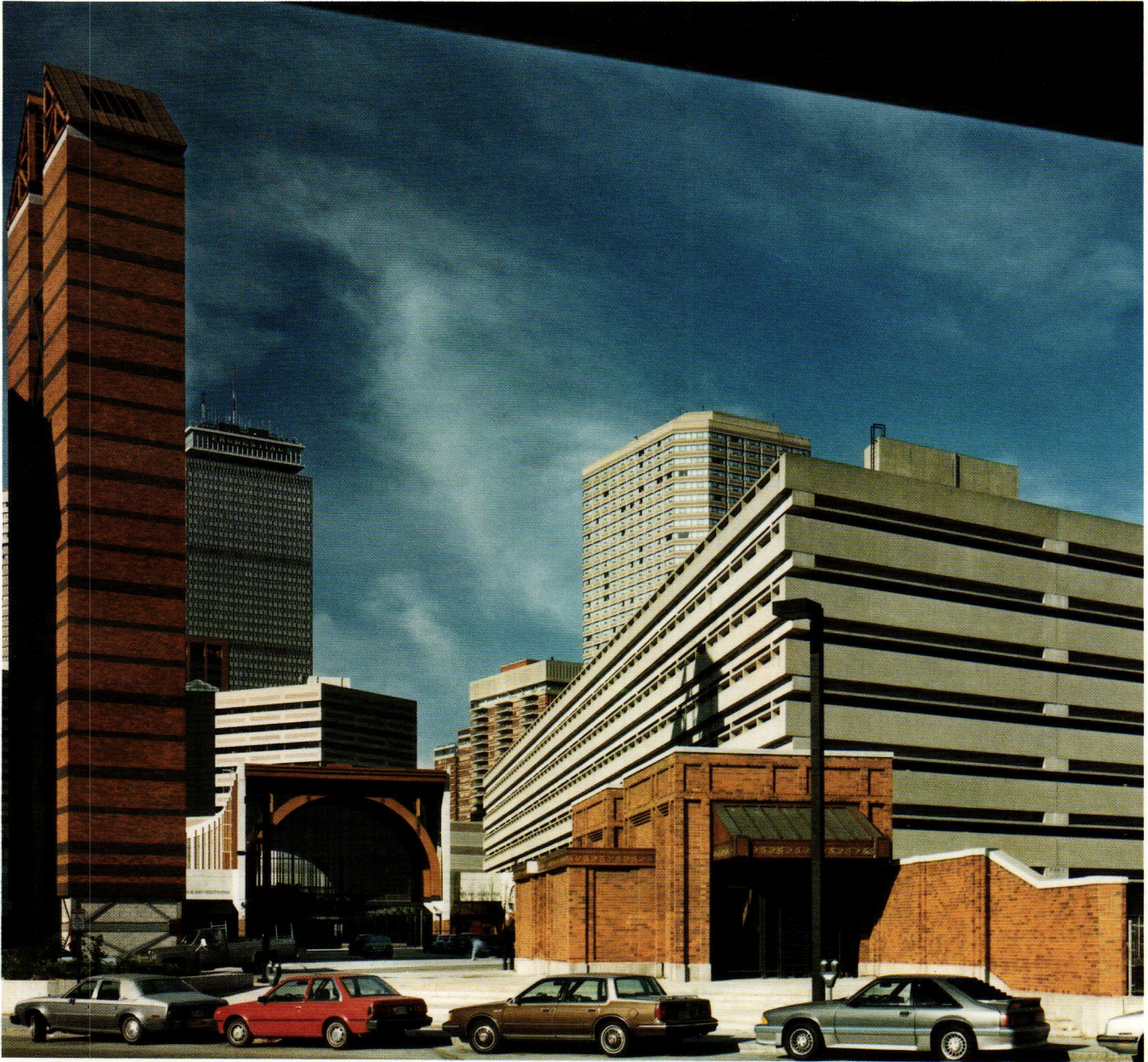
I Back Bay/South End station in Boston. The venting towers, the main hall, and the brick exitway kiosk viewed from Columbus Avenue looking west.