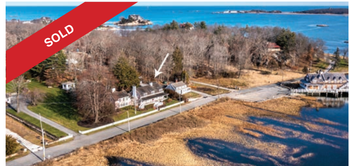
Cohasset | 90 Howard Gleason Road | $3,250,000

Wonderfully maintained home, situated on a corner lot on scenic Jerusalem Road, steps to Black Rock Beach. As you enter, you are greeted with a cozy fireplace living room. The kitchen with stainless appliances and the dining room open up to the deck outside. Down one level is a spacious family room with a fireplace and a new half bath. Down one more is an unfinished basement with great ceiling height. On the second level, you'll find an en suite primary bedroom with a new bathroom and a row of closets. Two more bedrooms and a new full bath. Up one level is a fantastic space that can be used as a bedroom, office or play space. Hardwood floors throughout and central AC! One car garage, plenty of parking for several cars. Located within a short distance of The Commuter Rail and Hingham Ferry to Boston.