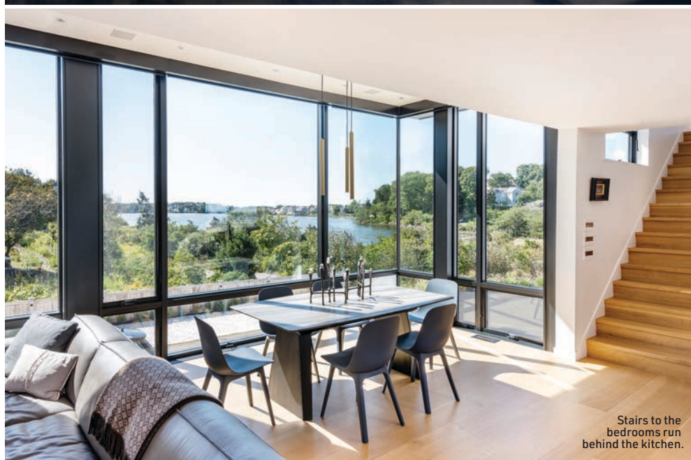
Stairs to the bedrooms run behind the kitchen.