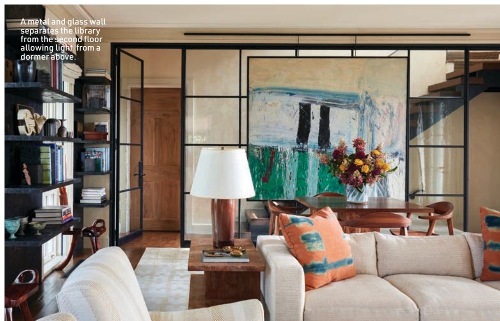
A metal and glass wall separates the library from the second floor allowing light from a dormer above.

dormers that connects to a series of single-story wings. Modeled on the local Amagansett farmhouse, the exterior tells the rambling home’s fictive narrative with subtlety: smaller panes on the windows of the “historic”