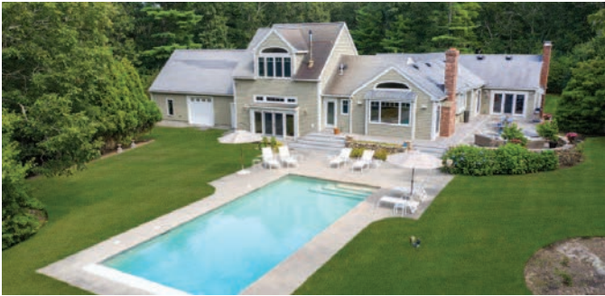
Cohasset | 62 Surry Drive | $2,395,000

Estate setting... this beautiful sprawling oversized home has it all. Privacy, professional landscaping, gorgeous in ground pool, cul-de-sac neighborhood, walk to Black Rock Beach, minutes from the train to Boston. The main level has an open layout perfect for hosting parties. A large gourmet kitchen featuring two islands lends itself to a family room, dining room and living room. Generous master suite has a new Master bath and large walk-in closet, 3 other bedrooms as well as a study. You will find a spacious office tucked away in its own wing for an ultimate private workspace. The second floor hosts a large space currently being used as a fitness room. The lower level could be a play room or game room—many possibilities. Property abuts 35 acres of conservation land.