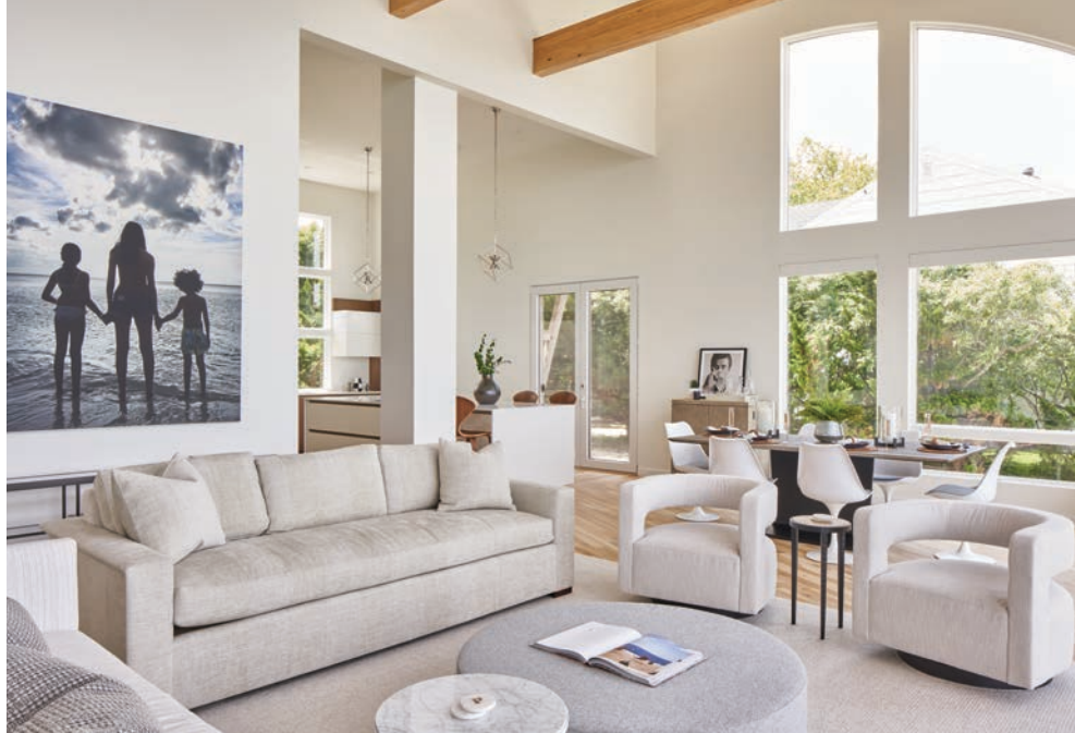
Top: Barely-there motorized sun shades run throughout the home.

In the dining area, midcentury modern-style tulip chairs surround a rectilinear table