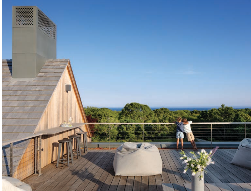
Clockwise from above: The expansive roof deck offers the best view of the ocean.

“What we like to do on modern houses, and what we did here, is blur the distinction between what is a door and what is a window,” says Lilley. “Instead of windows punched into a wall, we have big doors that slide open.” Even the master shower door