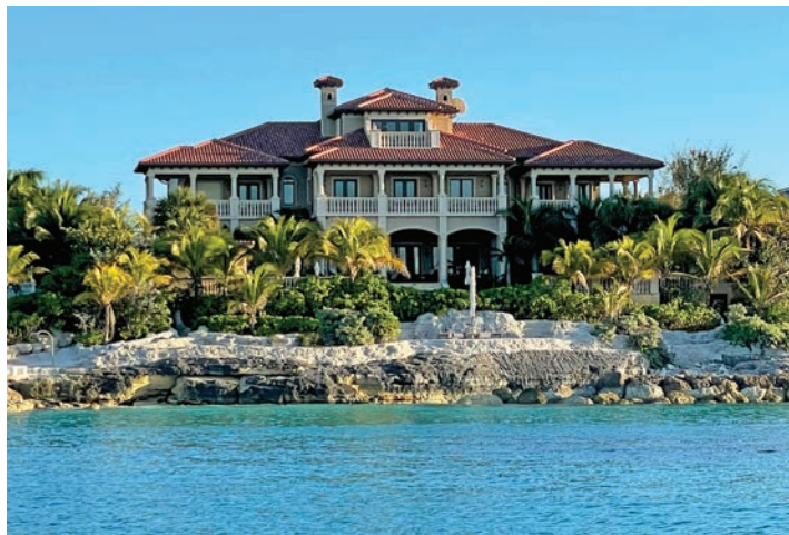
OLD FORT BAY, BAHAMAS