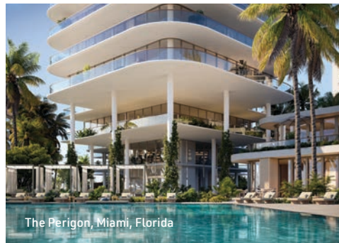
The Perigon, Miami, Florida