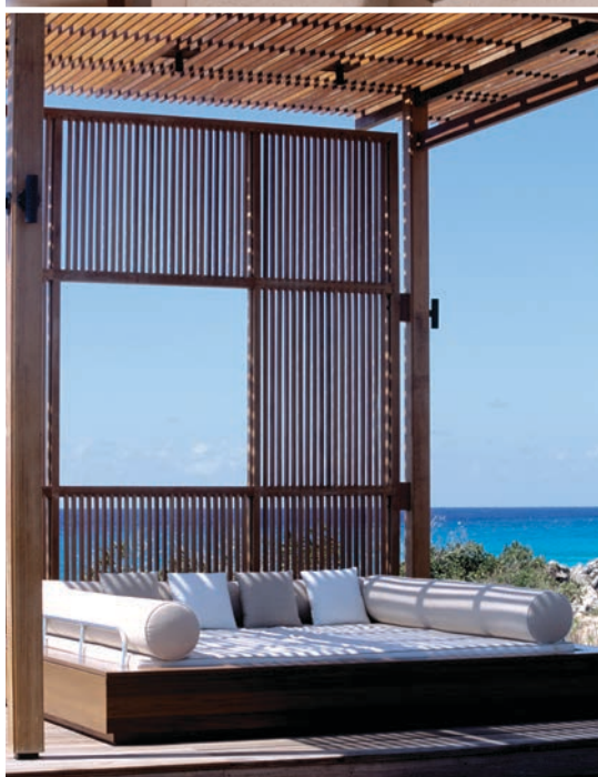
Amanyara's design seamlessly blends indoors and out. Enjoy a snack or drink in the open air from the patio (below) or a private sunset sala by the pool (center left).