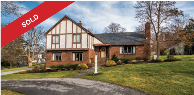
Cohasset | 708 Jerusalem Road | $1,195,000

Spectacular home in sought after prestigious neighborhood. Outstanding Jerusalem Road shingle and clapboard home with breathtaking Ocean Views. Home is completely renovated and has an amazing new private pool area. Savour the ocean breezes from the back yard and enjoy two beaches minutes away.