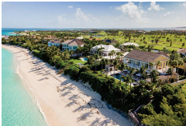
PARADISE ISLAND, BAHAMAS