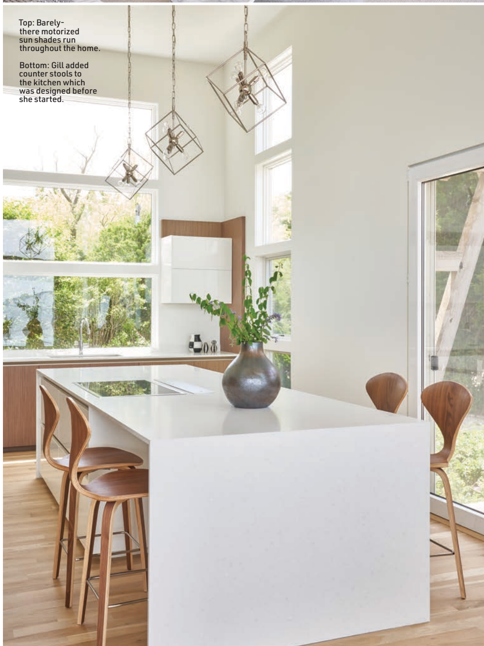
Bottom: Gill added counter stools to the kitchen which was designed before she started.