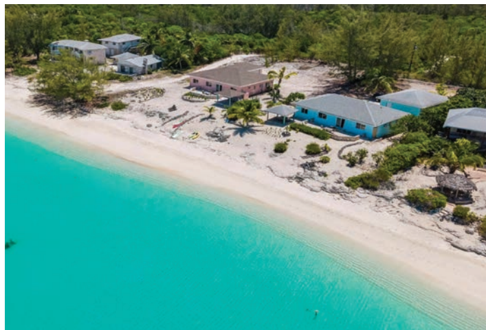
CAT ISLAND, BAHAMAS