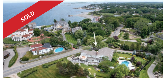
Cohasset | 364 Jerusalem Road | $3,500,000

Estate setting... this beautiful sprawling oversized home has it all. Privacy, professional landscaping, gorgeous in ground pool, cul-de-sac neighborhood, walk to Black Rock Beach, minutes from the train to Boston. The main level has an open layout perfect for hosting parties. A large gourmet kitchen featuring two islands lends itself to a family room, dining room and living room. Generous master suite has a new Master bath and large walk-in closet, 3 other bedrooms as well as a study. You will find a spacious office tucked away in its own wing for an ultimate private workspace. The second floor hosts a large space currently being used as a fitness room. The lower level could be a play room or game room—many possibilities. Property abuts 35 acres of conservation land.