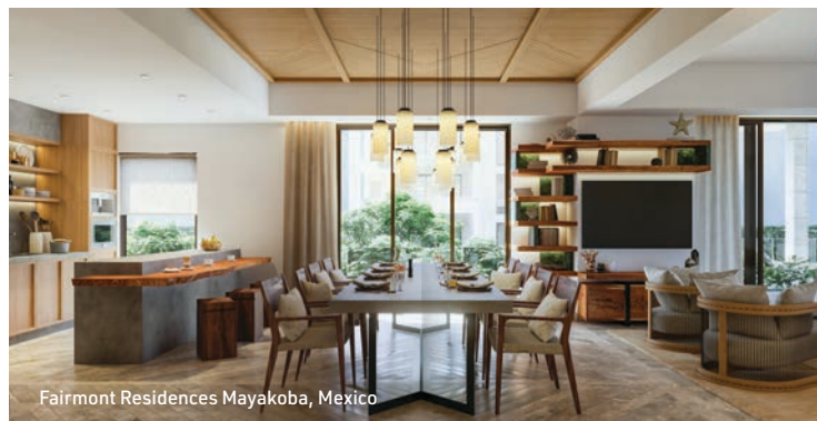
Fairmont Residences Mayakoba, Mexico