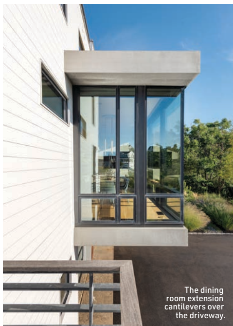
The dining room extension cantilevers over the driveway.