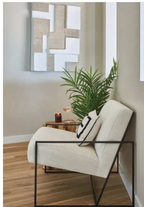
An RH lounge chair and an upholstered bench offer spots to relax in the primary bedroom. Gill used Cowtan & Tout fabric for the extra-long, custom lumbar pillow on the bed.