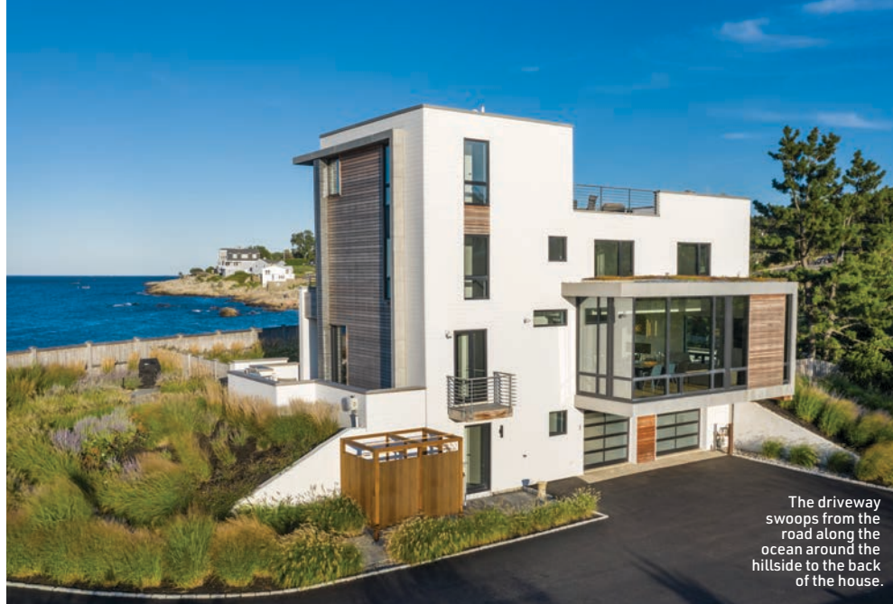
The driveway swoops from the road along the hillside to the back of the house.