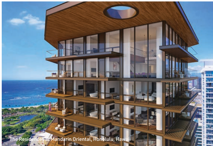
The Residences at Mandarin Oriental, Honolulu, Hawaii