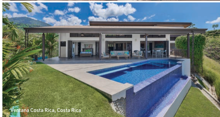
Ventana Costa Rica, Costa Rica