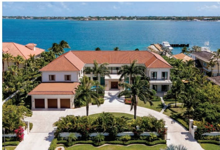
PARADISE ISLAND, BAHAMAS