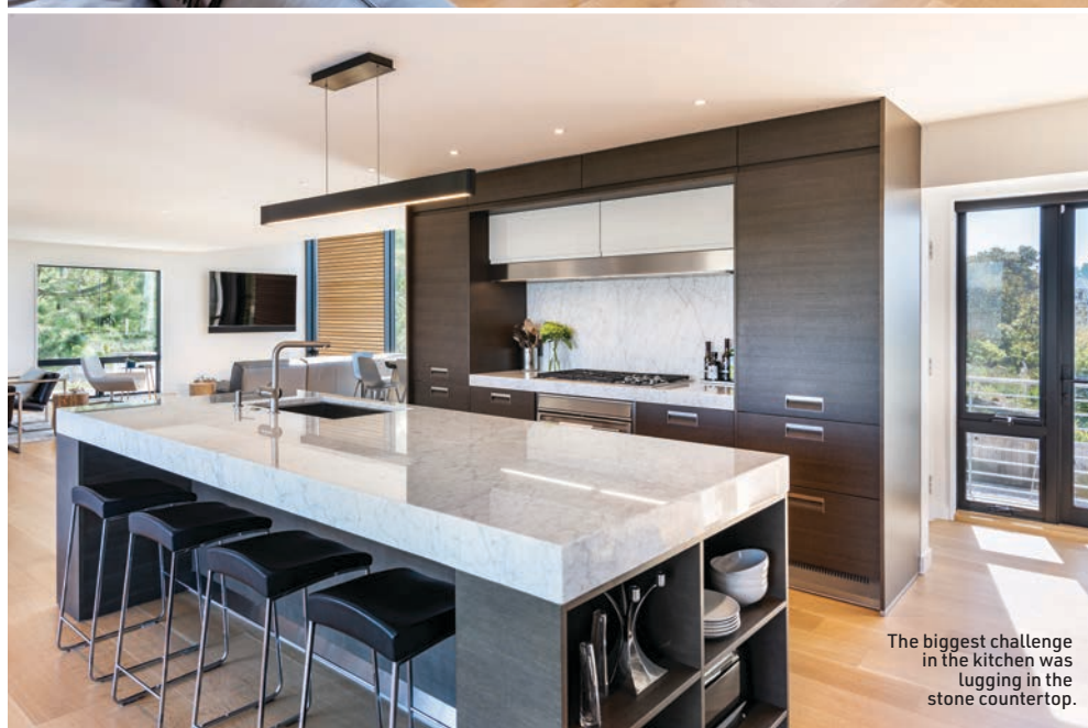
The biggest challenge in the kitchen was lugging in the stone countertop.