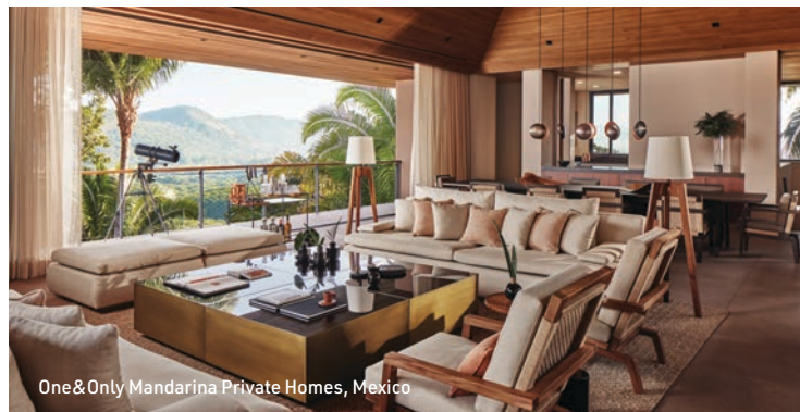
One&Only Mandarin Private Homes, Mexico