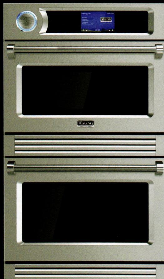
7-SERIES TURBOCHEF™ SPEEDCOOK DOUBLE OVEN Patented Airspeed Technology™ cooks food 15 times faster than conventional ovens

Only Viking lets you test drive with our 90-DAY NO QUIBBLE GUARANTEE