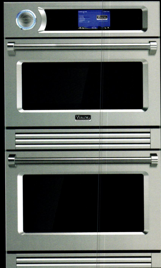
7-SERIES TURBO-CHEF DOUBLE OVEN Patented Airspeed Technology™ cooks 15 times faster than any conventional oven

BEFORE VIKING, HOME CHEFS HAD NO OPTIONS. WITH VIKING, THERE IS NO OTHER OPTION.