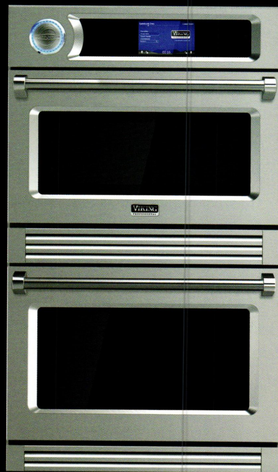
7-SERIES TURBO-CHEF DOUBLE OVEN Patented Airspeed Technology™ cooks 15 times faster than any conventional oven

BEFORE VIKING, HOME CHEFS HAD NO OPTIONS. WITH VIKING, THERE IS NO OTHER OPTION.