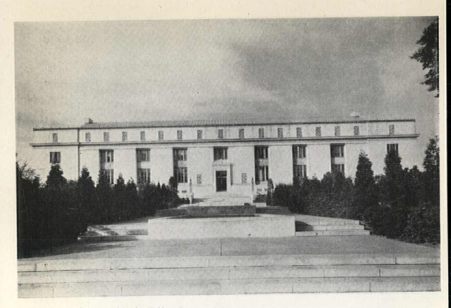
Do you know this building?

BEKLEVM C. GOODHUE, ARCHITECT THE NATIONAL ACCURAGE AND ACCURACY ACCURACY.