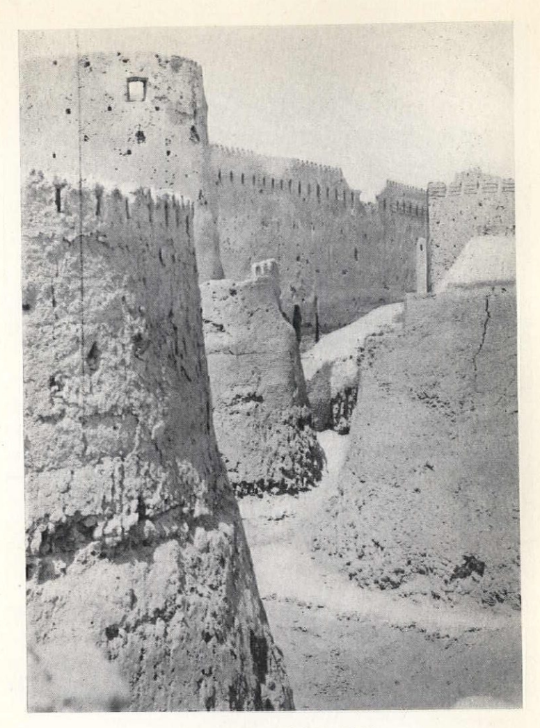
YEZD, IRAN: THE CITY WALL 12TH TO 14TH CENTURY