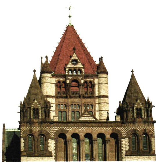
Trinity Church in Boston's Copley Square

We welcome comments on the new design of Columns: info@aiaphg.org