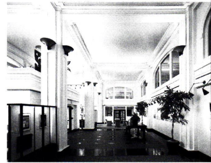
Art Institute of Pittsburgh

"This was a top-notch project. In regards to quality of the built environment, this facility is now considered to be the leader of all our schools across the country."