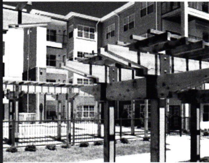
Lincoln at North Shore

"Without the assistance of our general contractor and major subcontractors from design development through construction, the Lincoln at North Shore may not have been developed. Today it is recognized as the most successful apartment community in the Pittsburgh metropolitan area."