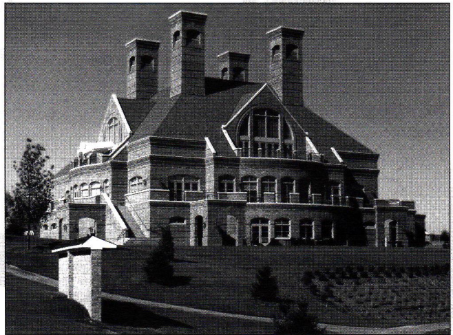
One of our recent projects, The Clubhouse at Nevillewood is now home to the Family House Invitational Golf Tournament.

No area general contractor is better known or more respected than John Deklewa and Sons.