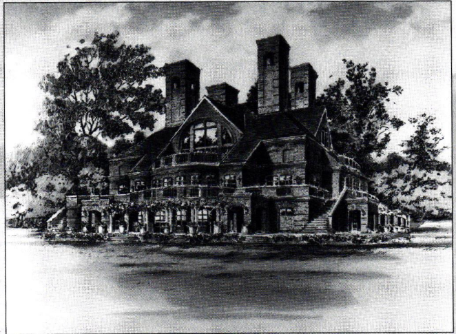
Our most recent project, The Clubhouse at Nevillewood is now home to the Family House Invitational Golf Tournament.

No area general contractor is better known or more respected than John Deklewa and Sons.