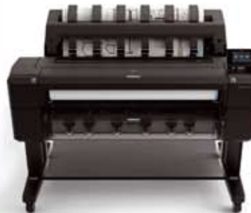
HP Designjet T1500 PS ePrinter