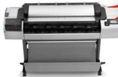
HP Designjet T2300 PS eMultifunction printer