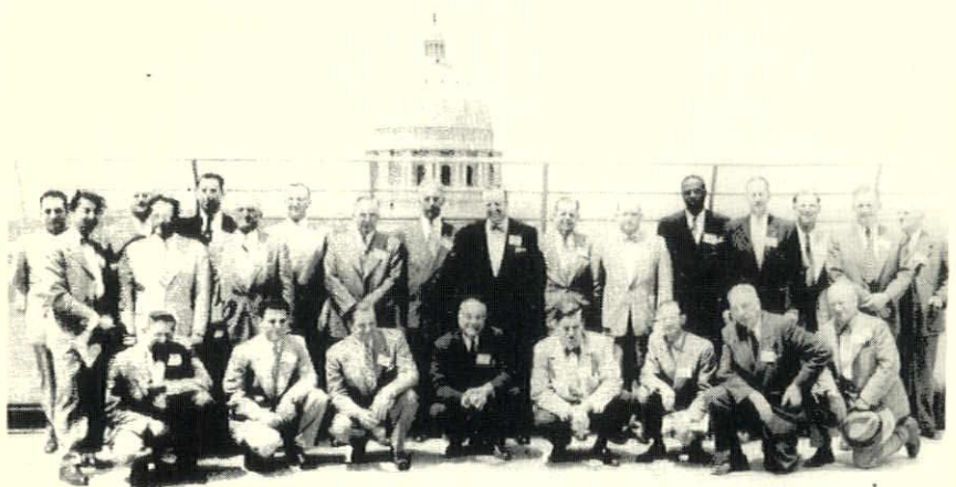
Officers, Directors and Members of the M. S. A. R. A. attending the Annual Architect's Day Meeting at Jefferson City, May 9, 1953.