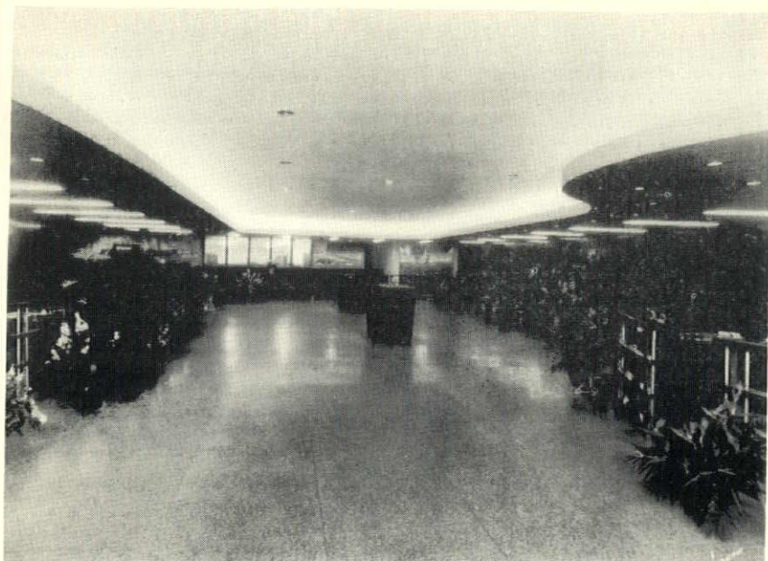
Interior View - Linwood State Bank - Kansas City, Missouri

Complete Bank Installations: Teller Cages, Counters, Check Desks, Low Rails, Panel Wainscot for Walls or Partitions; All as per Architects Plans and Specifications.