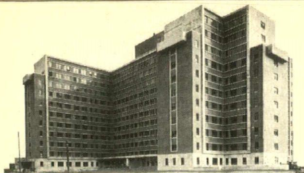
Veteran's Administration Hospital,