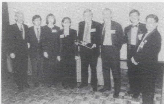
Gunnar Birkerts & Associates, Inc.