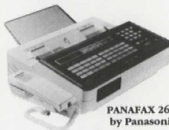
PANAFAX 260 by Panasonic

For Member Prices, call Toll-Free 9 am - 8 pm (EST) M - F