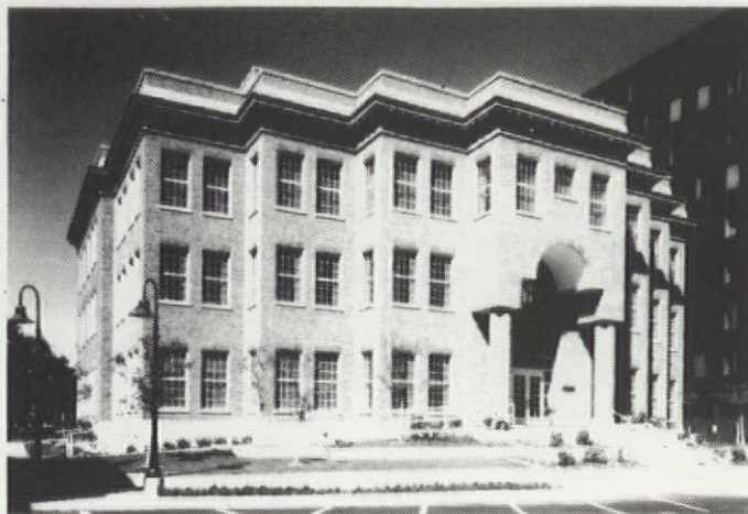
ECKERT/WORDELL ARCHITECTS OFFICE BUILDING, KALAMAZOO

The second Honorable Mention went to Tower, Pinkster, Titus Associates of Kalamazoo for the Horizon Health and Surgery Center in Livonia. Jury comment: "An inward oriented medical 'mall' with strong exterior forms quality materials and excellent colors."