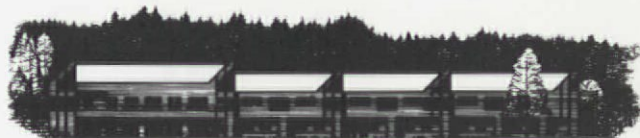
ECKERT/WORDELL ARCHITECTS J.M. WILSON CORPORATION