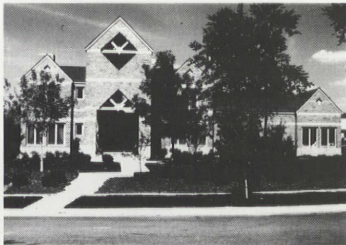
ECKERT/WORDELL ARCHITECTS HUNT FAMILY RESIDENCE