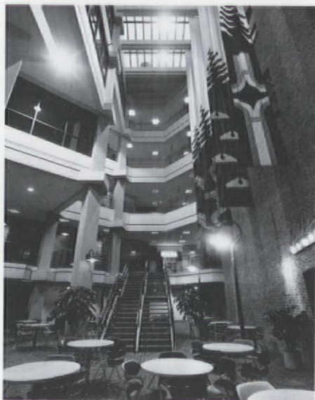
Ledyard Building Greiner, Inc. Grand Rapids, MI

The Grand Valley Chapter/AIA bestowed six honors in this year's Distinguished Building Awards Program. Greiner, Inc. received two accolades. One for a historic rehabilitation, the Ledyard Building, and the other for the Grand Valley Blood Center that is strikingly modern.