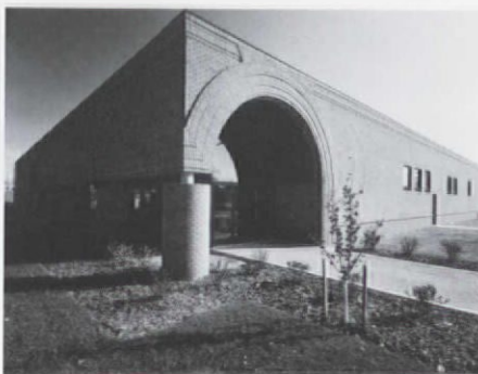
US Post Office — Holland, MI Progressive Architects Holland

Next to HUD with its low budget and entrenched bureaucracy, the U.S. Postal Services ranks high on the list of agencies that present innumerable obstacles to architects who hope to come up with a good design. Progressive Architects met the challenge head-on and produced a powerful and gutsy award winning post office in Holland.