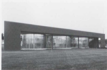
Grand Valley Blood Center Greiner, Inc. Grand Rapids

DSO Reid, Architects turned an old 1886 silk mill in Belding into the 71 unit Richardson Mill Apartments. They restored the exterior to National Register Standards, confronted the