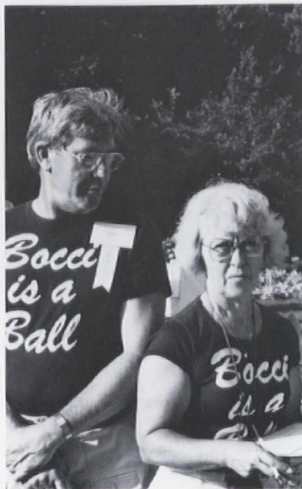
1987 MidSummer Conference Mackinac Island, MI

There will be a registration fee of $10.00 charged for each participant in the tennis mixer/tournament. To facilitate the necessary scheduling of court time, we are requesting that you pre-register for the mixer/tournament by filling out the registration form "B" and returning it to MSA HQ, no later than July 1, 1988.