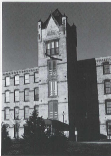
Richardson Mill Apartments DSO Reid, Architects, P.C. Belding

confining requirements and low budgets of MSHDA and HUD, and came away with an award winning project.