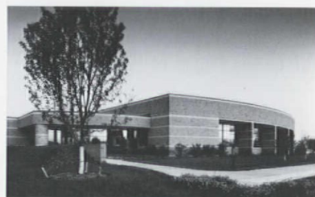
Steelcase Protection Services Design Plus, P.C. Grand Rapids

Design Plus, P.C. took a prize for the Steelcase Protection Services Building. In function it can be compared to a village fire house/police station but the program also required that the building survive destructive weather conditions. For all that, the jury from the St. Paul Minnesota Chapter/AIA declared the building to be both reserved and graceful.