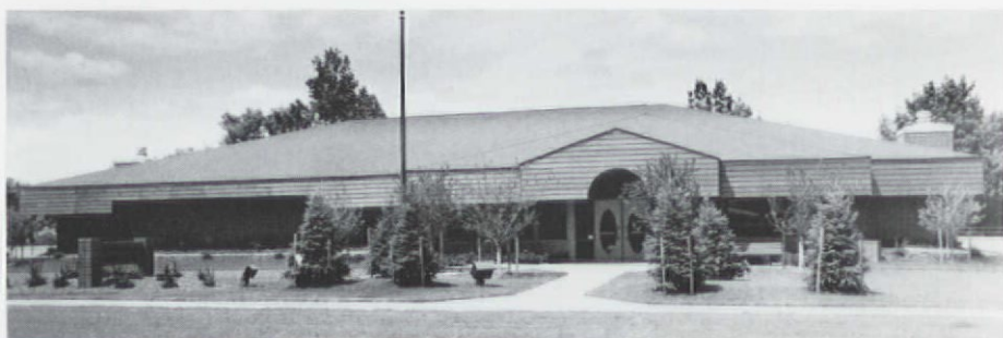
Mt. Pleasant City Hall: Otto-Duffy Architects, P.C.