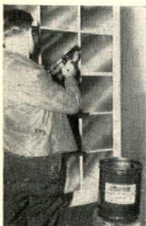
Caulking Gun with Special Nozzle used to apply Bedding Cement.

Out of the Plastic Products Laboratory has come a revolutionary advance in glazing wood sash—a better method and a better material. The glass is bedded in Plastoid Elastic Bedding Cement making a rubbery bond that will allow for all contraction and expansion and absolutely prevent leaks. Then the facing is applied in the usual way, with Glaza-Wood. The method and the material produce no-leak glazing, and eliminate the other faults characteristic of the old procedure. . . . Write for descriptive literature.