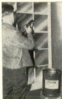
Caulking Gun with Special Nozzle used to apply Bedding Cement.

Out of the Plastic Products Laboratory has come a revolutionary advance in glazing wood sash — a better method and a better material. The glass is bedded in Plastoid Elastic Bedding Cement making a rubbery bond that will allow for all contraction and expansion and absolutely prevent leaks. Then the facing is applied in the usual way, with Glaza-Wood. The method and the material produce no-leak glazing, and eliminate the other faults characteristic of the old procedure. . . . Write for descriptive literature.