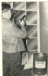
Caulking Gun with Special Nozzle used to apply Bedding Cement.

Out of the Plastic Products Laboratory has come a revolutionary advance in glazing wood sash—a better method and a better material. The glass is bedded in Plastoid Elastic Bedding Cement making a rubbery bond that will allow for all contraction and expansion and absolutely prevent leaks. Then the facing is applied in the usual way, with Glaza-Wood. The method and the material produce no-leak glazing, and eliminate the other faults characteristic of the old procedure. . . . Write for descriptive literature.