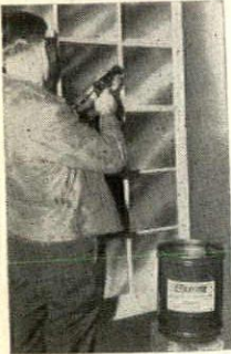
Caulking Gun with Special Nozzle used to apply Bedding Cement.

Out of the Plastic Products Laboratory has come a revolutionary advance in glazing wood sash — a better method and a better material. The glass is bedded in Plastoid Elastic Bedding Cement making a rubbery bond that will allow for all contraction and expansion and absolutely prevent leaks. Then the facing is applied in the usual way, with Glaza-Wood. The method and the material produce no-leak glazing, and eliminate the other faults characteristic of the old procedure. . . . Write for descriptive literature.