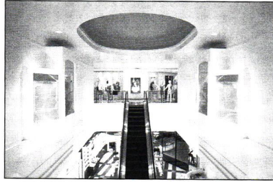
4 The Retail Explosion on Guam