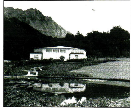
16 Oahu Pumping Stations