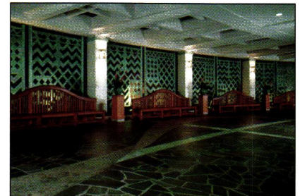
26 Design Award