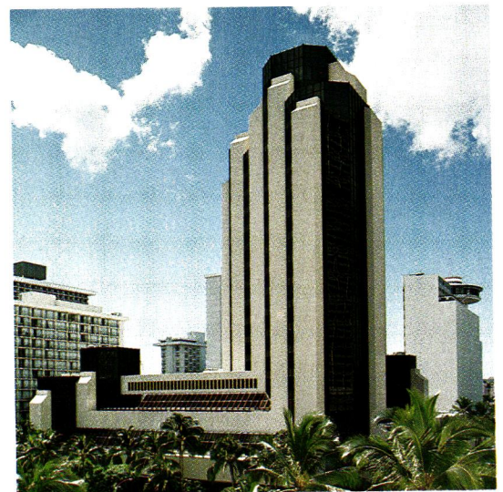
High Build Elastomeric Wall Coatings