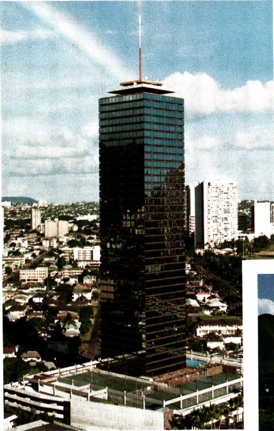
Elastomeric Coatings for Parking Decks and Lanais

Complete Weatherproofing and Restoration