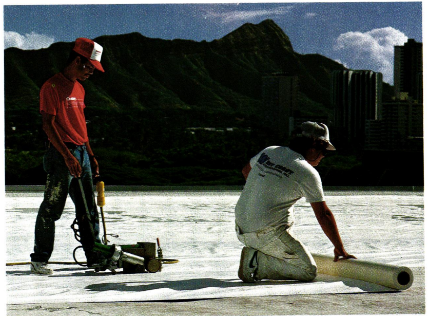
Single Ply Roofing