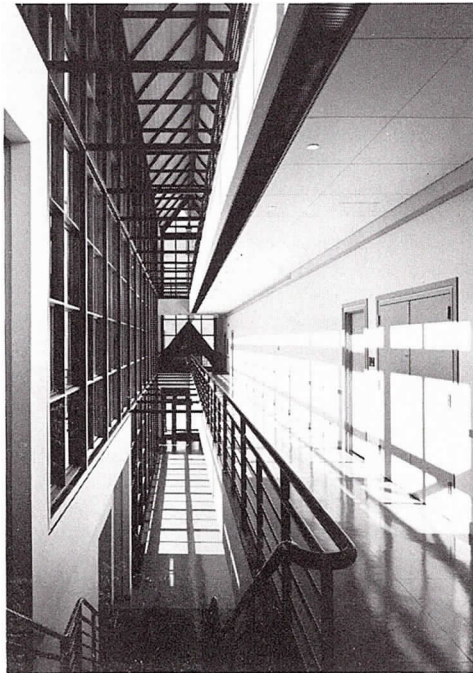
Kersten Physics Teaching Center, University of Chicago will be site and topic of Architects in Government/Industry/Education Committee program.