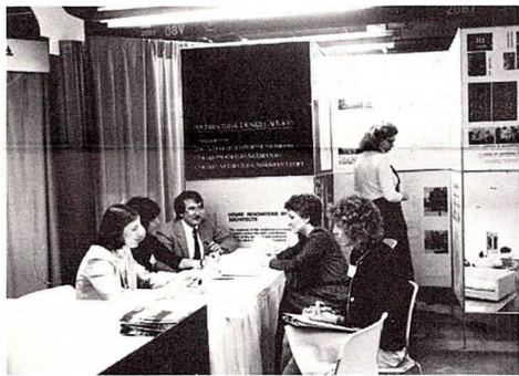
"How do I select an architect"

This year at City House, the ArchiClinic booth was staffed by sixteen architects representing the Chicago Chapter of the American Institute of Architects, Chicago Women in Architecture and the Chicago Architectural Assistance Center. Over the three-day period of the exhibition the CCAIA, CWA and CAAC volunteers spoke to over 150 people. Questions were diverse but mainly dealt with the selection of an architect, the range of services, the fees charged, and most individuals sought specific information on structural, technical or design questions.