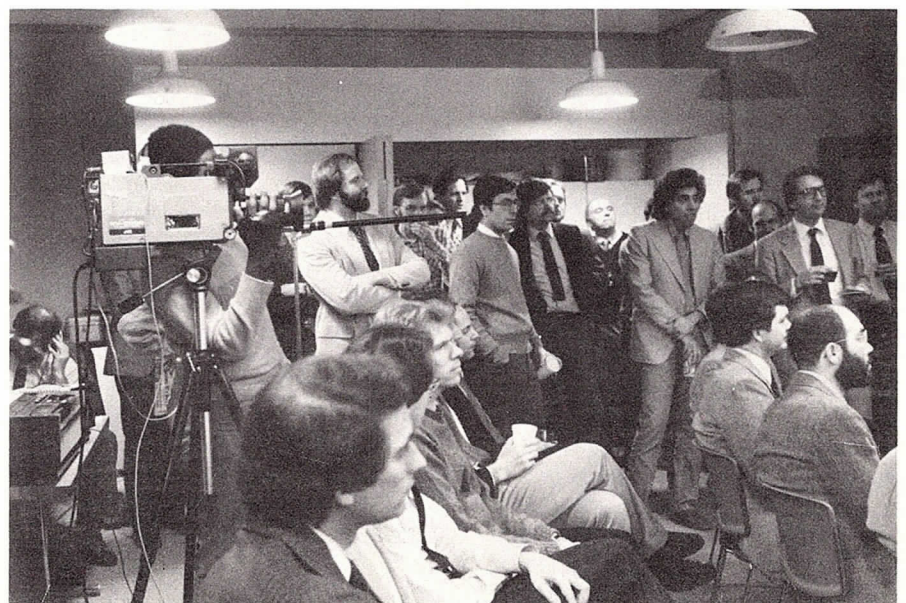
Video crew & design enthusiasts jam CCAIA Board Room