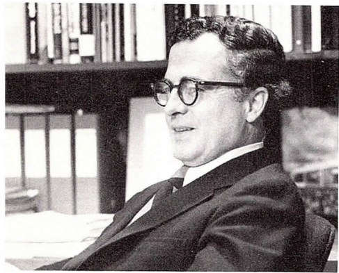
1st Vice President/ President Elect