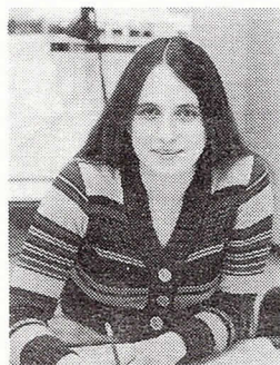
Vice President Two Years