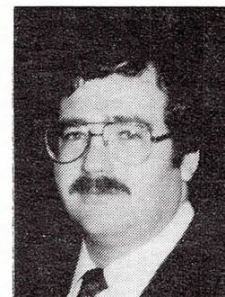
Associate One Year