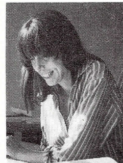
Director Three Years