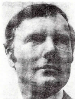
Director Three Years